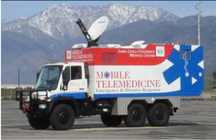
Mobile Surgical Vehicle - California, USA