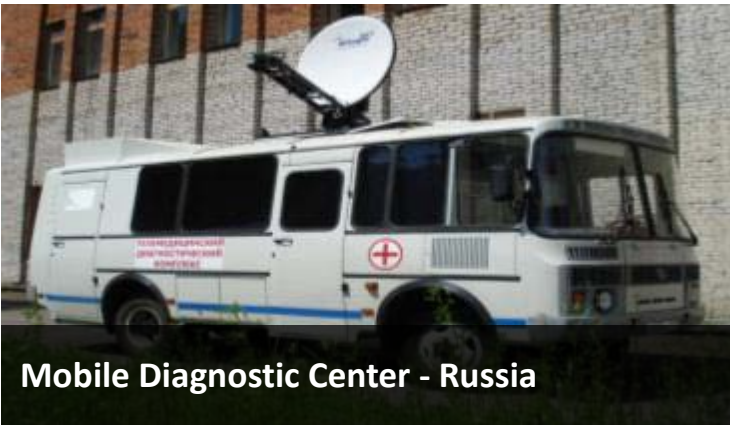
Mobile Diagnostic Center - Russia