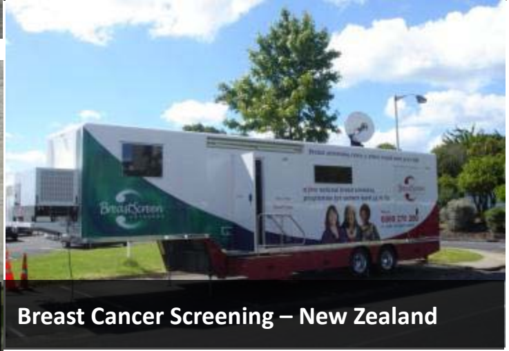
Breast Cancer Screening – New Zealand