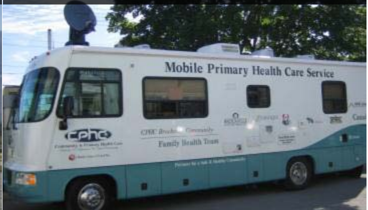
Mobile Health Clinic - Brockville, Canada