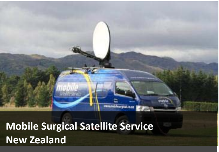
Mobile Surgical Satellite Service New Zealand