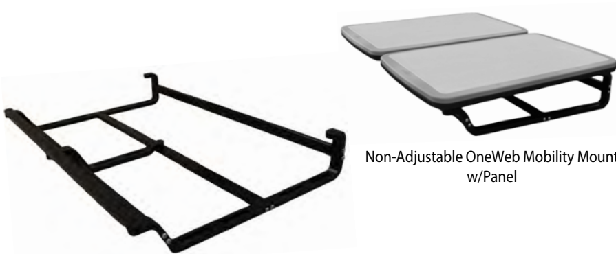
Non-Adjustable OneWeb Mobility Mount w/Panel