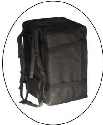
Soft Case Solution (Rear View)