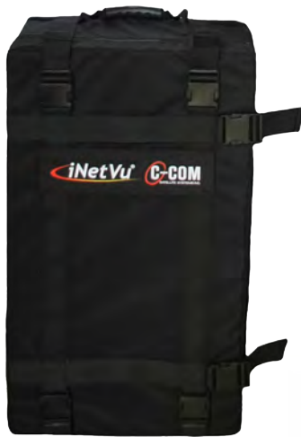
Soft Case Solution (Front View)

The iNetVu ® MP-100-MOT is a fully motorized, auto-acquire, 100 cm carbon fiber Manpack antenna. This robust and lightweight system will point to any programmed satellite with just the push of a button on the NEW iNetVu ® 8020 Controller. C-COM's highly portable, multi-segment Manpack can be hand-carried by one person and assembled in less than 10 minutes with no tools required.